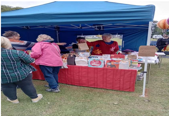
Carnoustie Trinity Stall