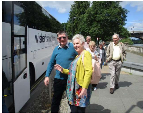
Where to next?