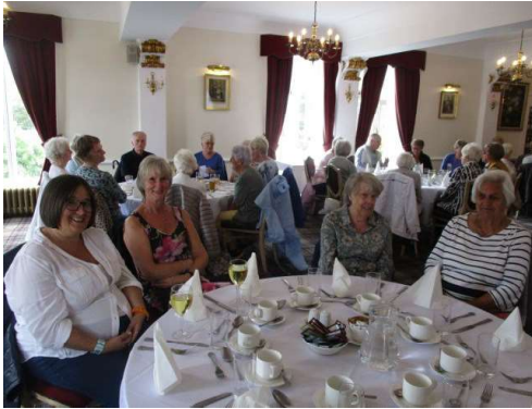
Lunch in Perth