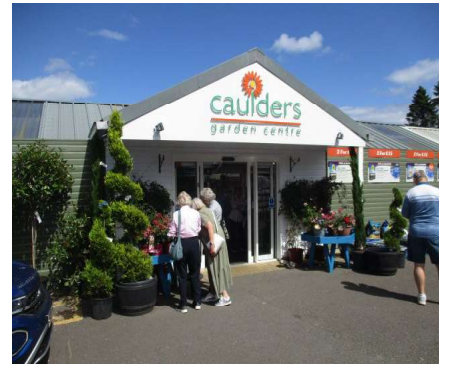
Caulders in Cupar