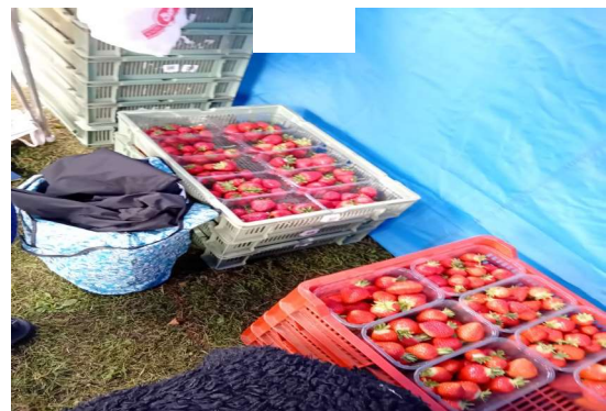
Strawberries sold well - all gone